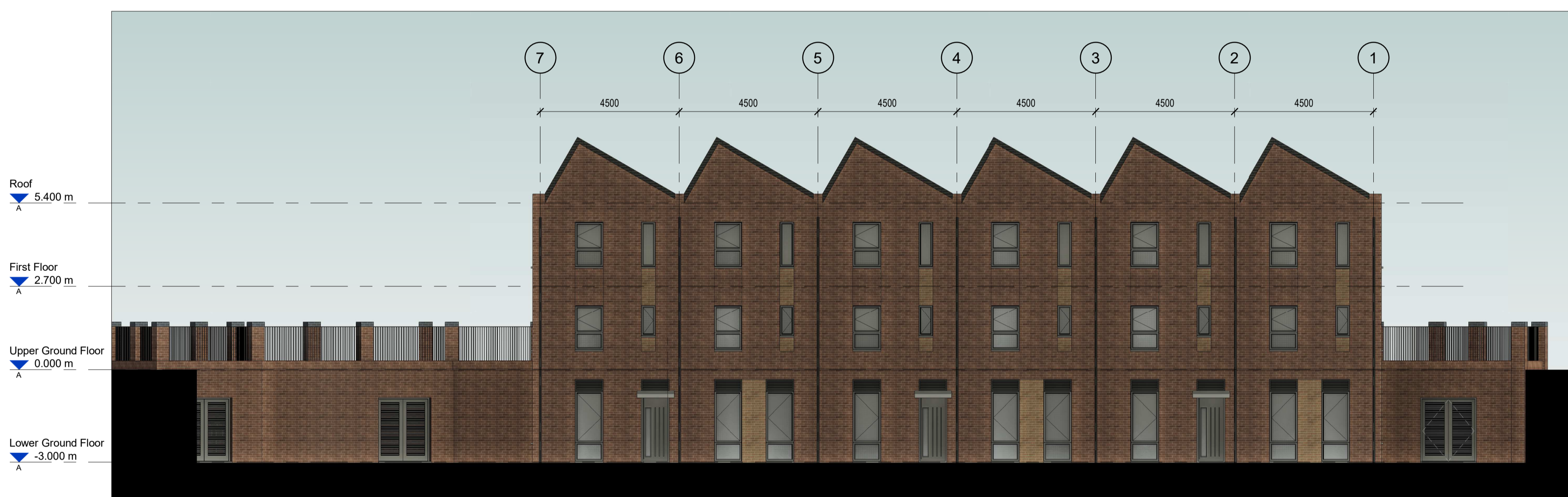
2 NORTH-EAST 1 : 100

Note: Brick garden walls to boundary gable and garden ends with timber division fences.