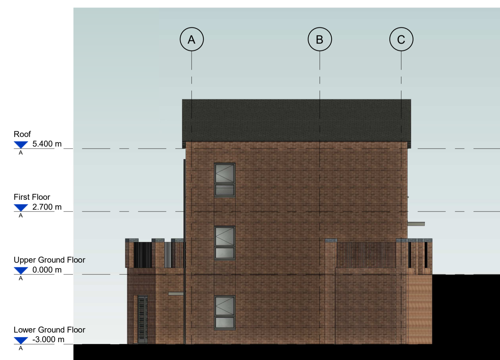
4 NORTH-WEST 1 : 100